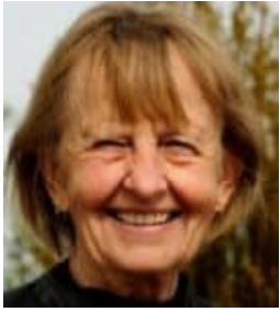
Author Sonja Nelson

Rhododendrons in our gardens, along with the native state flower Rhododendron macrophyllum , the Western or Pacific rhododendron in our woodlands, are facing the vagaries of climate change here in the Pacific Northwest as well as worldwide. Gardeners in our moderate climate can no longer assume our benevolent climate will continue its unstinting support for the genus Rhododendron . According to the World Meteorological Organization, the average global temperature in 2024 was the warmest year on record at about 2.7° F or 1.55° C above preindustrial levels. Higher temperatures do not bode well for rhododendrons. They like moderation!