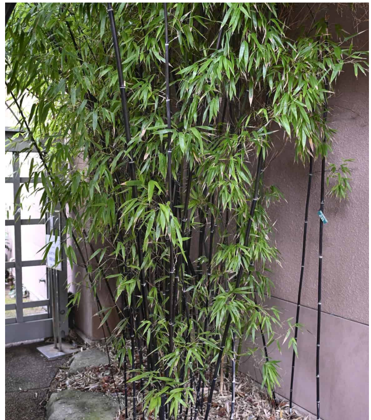
Phyllostachys nigra 'Black Bamboo' grown against a foundation and contained by a sidewalk at the Elisabeth C. Miller Library in Seattle. In this shady contained location, it will not grow to its unconstrained height of 35'.