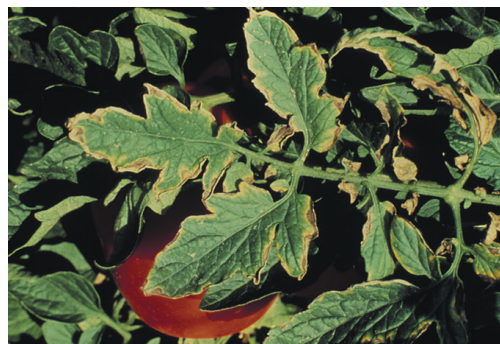
Figure 17. Marginal browning of leaves caused by bacterial canker