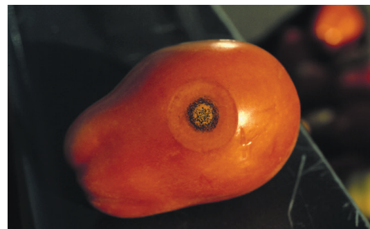
Figure 6. Anthracnose fruit rot

Anthracnose, caused by the fungus Colletotrichum coccodes and C. acutatum , is probably the most common fruit-attacking disease of tomato in Iowa. Symptoms first become visible on ripe or ripening fruit as small, sunken, circular spots in the skin. As these spots expand, they develop dark centers or concentric rings of dark specks, which are the spore-producing bodies of the fungus (Figure 6). In moist weather these bodies exude large numbers of spores,