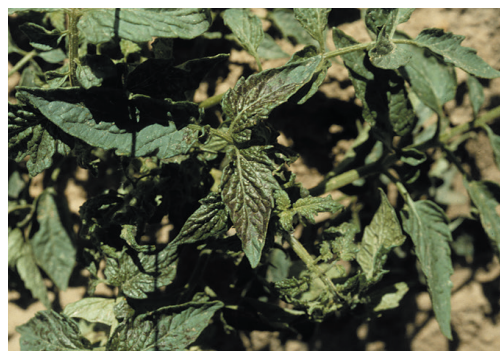
Figure 20. Purplish discoloration of tip leaves caused by TSWV