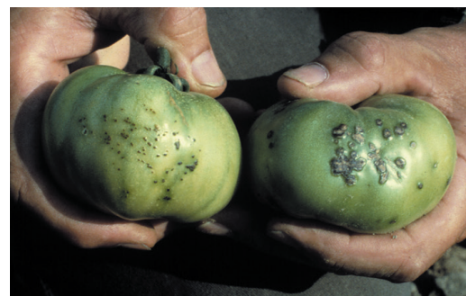
Figure 14. Fruit spots caused by bacterial speck (left) and bacterial spot (right)

is necessary, because wounds caused by handling allow bacteria to enter plants. Sprays of a fixed copper product can reduce spread of the disease if applications begin when first symptoms appear and are rotated with chlorothalonil or sulfur products. This practice delays the potential development of copper insensitive bacterial populations (known also as resistance).