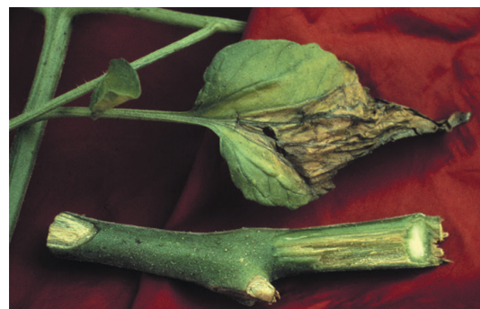
Figure 9. Verticillium wilt foliage symptoms and cut stem showing browning

Verticillium alboatrum and Verticillium dahliae , the fungi that cause Verticillium wilt is soilborne and can attack over 200 plant species, including potato, pepper, eggplant, strawberry, watermelon, and radish. Like Fusarium wilt, this disease appears first on the lower leaves and progresses upward. Yellow blotches develop on lower leaves; the leaves rapidly turn completely yellow, wither, and drop off (Figure 9). Unlike Fusarium wilt, symptoms of Verticillium wilt do not progress along one side of a leaflet, branch, or plant. Infected plants may survive through the growing season, but are stunted and yield is reduced. Verticillium wilt, like Fusarium wilt, causes internal browning of the water-conducting tissue in stems (Figure 9). The discoloration is most pronounced near the soil line and seldom extends more than 10 to 12 inches above this point.