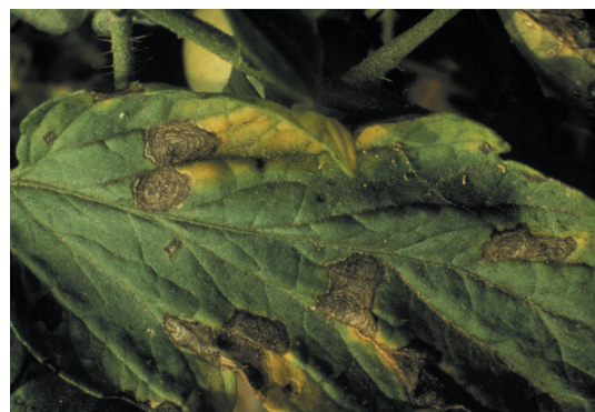
Figure 4. Early blight rot on foliage

by the common name. Leaves turn yellow and dry up when only a few spots are present. The fungus occasionally attacks fruit causing large, sunken areas with concentric rings and a black, velvety appearance (Figure 5). Warm, wet weather favors rapid spread of early blight. A. solani can also infect potato.