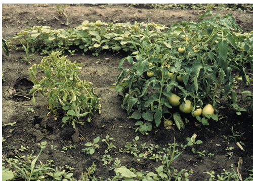
Figure 21. Dwarving of plant (left) by TSWV

Thrips, which are small (1/32 to 9/16 of an inch long) green-brown insects, spread the virus. Plants can be affected as transplants while growing in a greenhouse; after transplanting, stunting and failure to set fruit may be the most noticeable symptoms (Figure 21).