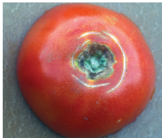
Figure 28. Concentric fruit cracking

in water availability to the plant. Fruit that has reached the ripening stage during dry weather may show considerable cracking if the dry period is followed by heavy rains and high temperatures. Tomato varieties differ considerably in the amount and severity of cracking under climatic conditions. As with blossom end rot, mulching and avoiding heavy applications of nitrogen fertilizer should help reduce fruit cracking.