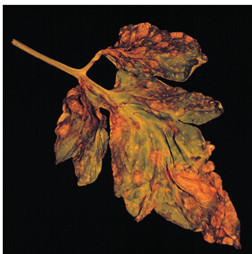
Figure 25. Blighting of leaflet by powdery mildew

Blossom end rot is caused by a calcium deficiency that is related to wide fluctuations in available soil moisture. Iowa soils contain plenty of calcium, so the addition of calcium will not solve the problem. To prevent blossom end rot, maintain a steady rate of plant growth without stress. A consistent and ample supply of soil moisture can reduce the problem by helping to maintain a steady flow of calcium from the soil to the fruit. Mulching will also help by conserving soil moisture. Blossom end rot is more serious when an excess of nitrogen fertilizer has been applied. Staking and pruning tomato plants may also increase the incidence of blossom end rot. If blossom end rot occurs, remove the affected fruit so that later-maturing fruit will develop normally. Mulching and avoiding heavy applications of nitrogen fertilizer may help reduce fruit symptoms.