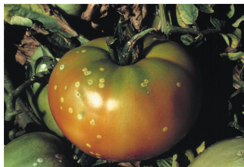
Figure 18. Fruit spots caused by bacterial canker