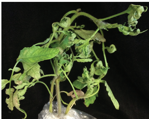
Figure 33. Herbicide damage

points. Leaves often become narrow and twisted toward the tip, with prominent, light-colored veins. The symptoms are most pronounced on portions of the plant that were actively growing when the exposure occurred. In severe cases, stems and petioles become thick, stiff, and brittle with warty outgrowths (Figure 33). Affected plants may recover. However, the fruit may become catfaced or develop in a plum shape, and may be hollow and seedless.