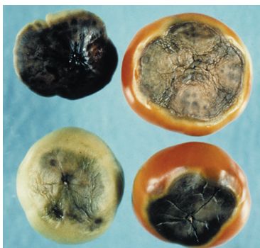
Figure 26. Blossom end rot