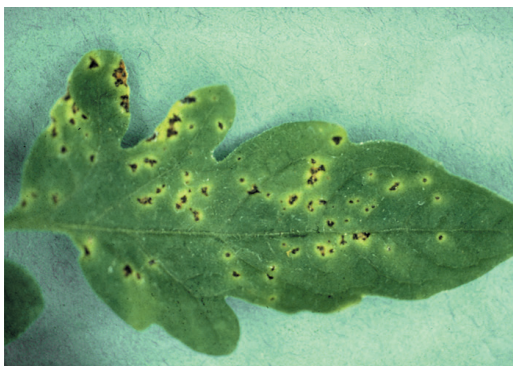
Figure 15. Bacterial speck on leaflet

The most common virus disease in Iowa is tomato spotted wilt virus (TSWV), but others can occur. TWSV causes distinctive yellow ringspots on mature fruit (Figure 19). Foliage can also be affected; plants are usually stunted and tip leaves show a purplish discoloration (Figure 20).