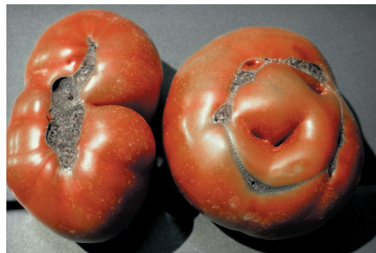
Figure 29. Catfaced fruit

Catfacing is a term used to describe misshapen fruit with irregular bulges at the blossom end and bands of leathery scar tissue (Figure 29). Cold weather at the time of blossom set distorts and kills certain cells that should develop into fruit, resulting in the deformities. The