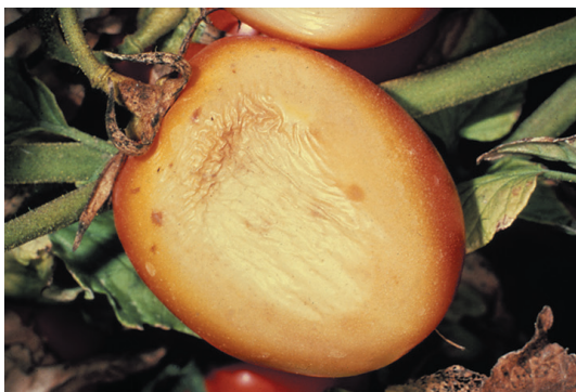
Figure 30. Sunscald

Sunscald occurs on green tomato fruit exposed to the sun. The initial symptom is a whitish, shiny area that appears