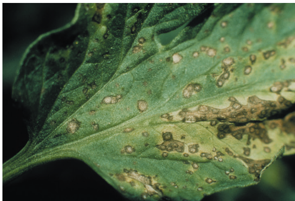
Figure 2. Septoria leaf spot; the light-colored centers distinguish them from leaf spots caused by bacterial spot and speck.

The lesions gradually develop grayish white centers with dark edges (Figure 2). The light-colored centers of these spots are the most distinctive symptom of Septoria leaf spot. When conditions are favorable, fungal fruiting bodies appear as tiny black specks in the centers of the spots. Spores are spread to new leaves by splashing rain or overhead watering. Heavily infected leaves turn yellow, wither, and eventually fall off. Lower leaves are infected first, and the disease progresses upward if rainy weather persists. Defoliation can be severe after periods of prolonged warm, wet weather (Figure 3). Infection can occur at any stage of plant development, but appears most frequently after plants have begun to set fruit. The fungus survives the winter in tomato debris. Management of this disease should combine the cultural and chemical tactics described above.