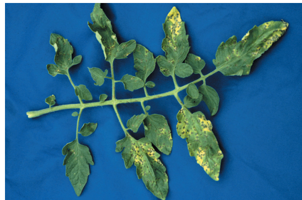
Figure 1. Septoria leaf spot symptoms

Septoria leaf spot, caused by the fungus Septoria lycopersici , is the most common foliar disease of tomatoes in Iowa. It first appears as small, water-soaked spots that soon become circular spots about 1/8 inch in diameter (Figure 1).