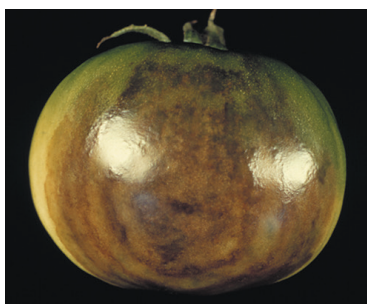
Figure 11. Fruit rot caused by late blight

Infection of green or ripe fruit produces large, irregularly shaped brown blotches (Figure 11). Infected fruit rapidly deteriorate into foul-smelling masses. Late blight usually appears in mid or late August during persistent cool, wet weather, or when cool night temperatures cause frequent heavy dews. P. infestans causes similar symptoms on potatoes, and can spread from potatoes to tomatoes.