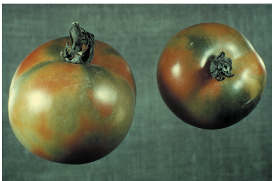
Figure 31. Blotchy ripening

This physiological disorder is indicated by the absence of normal red pigment on localized areas of the