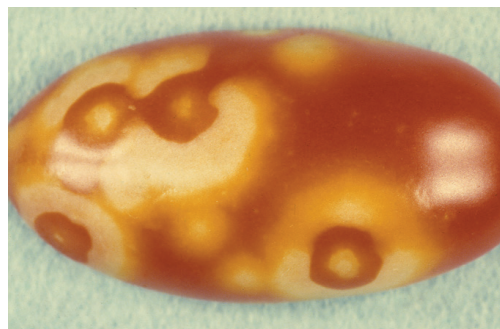
Figure 19. TSWV ringspots on a fruit