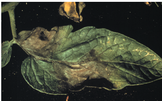
Figure 10. Late blight symptoms on leaflet

a frost-damaged appearance. The undersides of the leaves often show a downy white growth in moist weather.