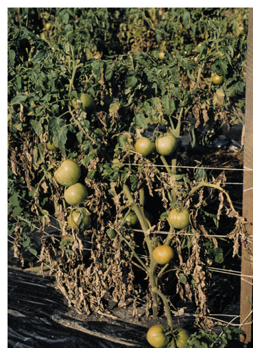
Figure 13. Wilting caused by bacterial spot

Bacteria can be transmitted to seedlings from contaminated seeds. Avoid rotating with peppers. It is advisable to avoid handling plants (pruning and tying, for example) any more than