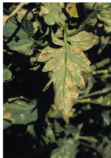
Figure 24. Buff-colored spore masses of leaf mold on underside of leaflet

disease appears on lower leaves as yellow spots on the upper surface (Figure 23). Under humid condition, fuzzy masses of buff-colored spores form on the leaf underside (Figure 24). These leaves drop prematurely as the disease progresses upwards on the plant. Lowering greenhouse humidity, increasing plant spacing, pruning and training to encourage air flow, planting resistant varieties, (on seed catalogs, look for abbreviation include Cf, Cf-2, -4, -9, -11, or Ff) and applying fungicides preventively and promptly can be helpful in leaf mold management.