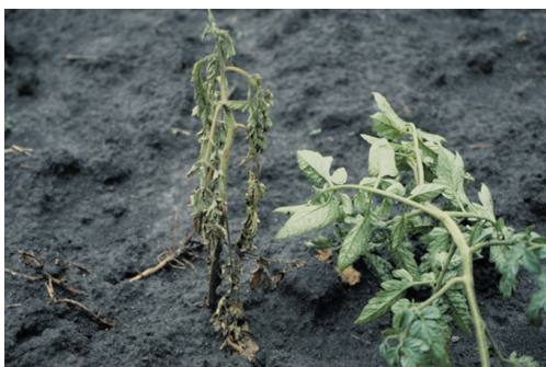
Figure 16. Wilting of a young transplant (center) caused by bacterial canker