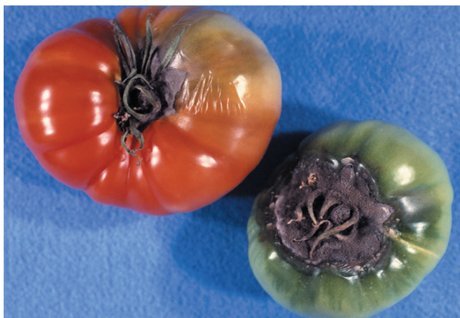
Figure 22. Gray mold on fruit

Gray mold is caused by the fungus Botrytis cinerea . This disease is characterized by a light-gray fuzzy growth