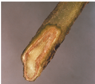
Figure 8. Vascular browning caused by Fusarium wilt

To minimize losses from Fusarium wilt, it is advisable to plant resistant varieties, and many resistant varieties are available. The letter “F” following the variety name indicates resistance to one or more races of the Fusarium fungus. Resistant varieties may become infected, but disease will not be as severe as with susceptible varieties and a reasonable yield should still be obtained. Plant disease-free seed or transplants in well-drained, disease-free soil, rotate at least four years away from tomatoes to reduce populations of the fungus in soil, and remove and destroy infected plant residue. In greenhouse or seedbeds, disinfest soil by treating with steam. For high value high tunnel operations where Fusarium may be established in the soil, grafting may be a suitable practice. Visit www.extension.iastate.edu/vegetablelab for more information.