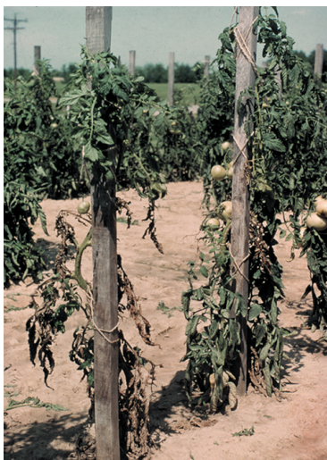
Figure 7. Fusarium wilt

Fusarium oxysporum f. sp. lycopersici , the fungus that causes Fusarium wilt, attacks only certain tomato cultivars. Plants infected by this soil-dwelling fungus show leaf yellowing and wilting that progress upward from the base of the stem. Initially, only one side of a leaf midrib, one branch, or one side of a plant will be affected. The symptoms soon spread to the remainder of the plant (Figure 7). Wilted leaves usually drop prematurely. Affected plants die early and produce few, if any, fruit. Splitting open an infected stem reveals brownish streaks extending up and down the stem (Figure 8). These discolored streaks are the water-conducting tissue, which becomes plugged during attack by the fungus, leading to wilting of the leaves. Plants are susceptible at all stages of development, but symptoms are most obvious at or soon after flowering. Fusarium is a soilborne pathogen that may persist in the soil for up to 10 years. Laboratory confirmation is recommended. Visit the clinic.ipm.iastate.edu for services fees and sample collection guidelines.