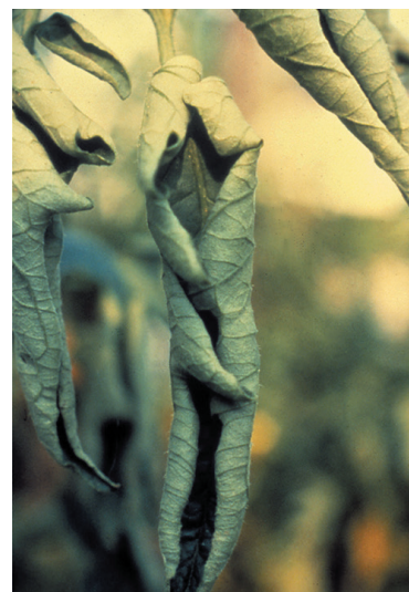
Figure 32. Physiological leafroll

Physiological leafroll occurs when the edges of the leaves roll upward and inward (Figure 32). Sometimes the curling continues until the leaf margins from either side touch or overlap. Some leaves on the plant may not exhibit rolling. Leafroll does not reduce plant growth, yield, or fruit quality. It is believed to result from irregular water supply, and may be intensified following pruning. The symptoms are sometimes temporary, disappearing after a few days, but can persist throughout the growing season.