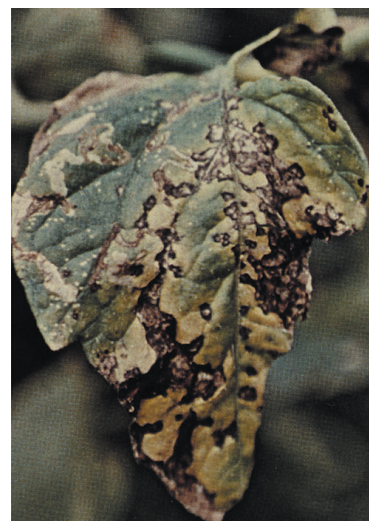
Figure 12. Bacterial spot on leaflet

and leaves wither and turn brown (Figure 13). Fruit symptoms are more distinctive than leaf or stem symptoms. Spots on green fruit first appear as black, raised, pimple-like dots surrounded by water-soaked areas. As the spots enlarge to 1/4 to 1/2 inch, they become gray-brown and scabby with sunken, pitted centers (Figure 14). The bacterium overwinters on the surface of seeds, in infected debris, and in soil. It is commonly brought into fields on infected transplants. Warm, rainy weather favors rapid spread of bacterial spot.