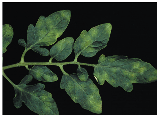
Figure 23. Yellow spots caused by leaf mold on upper leaf surface

Leaf mold, caused by the fungus Passalora fulva , can cause problems in humid greenhouses with poor air circulation. This fungal