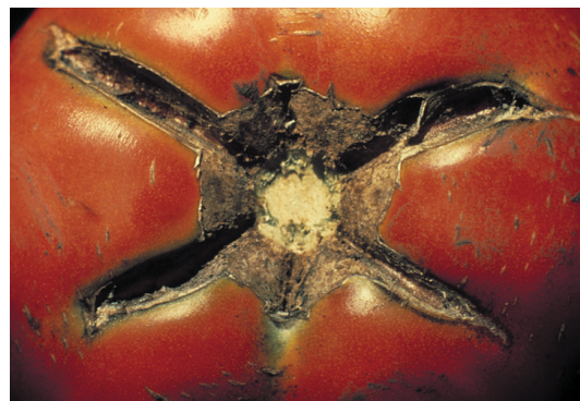
Figure 27. Radial fruit cracking

Two types of cracks may develop on tomato fruit. Radial growth cracks radiate from the stem (Figure 27), and concentric cracks encircle the fruit, usually on the shoulders (Figure 28). Similarly to blossom end rot, cracking is associated with rapid fruit development and wide fluctuations