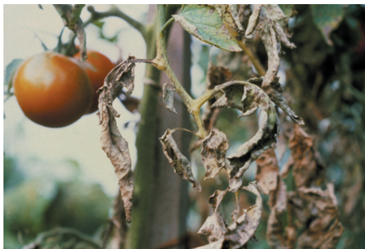
Figure 3. Defoliation caused by both Septoria leaf spot and early blight

Early blight, caused by the fungus Alternaria solani , is also known as Alternaria leaf spot or target spot. Like