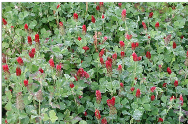
Figure 6. Crimson clover in bloom.

It also does not compete as well with cereals and is often grown alone or with annual ryegrass. It grows best when planted in the first half of September.