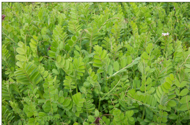
Figure 5. Common vetch in early spring in the stage of early vegetative growth.