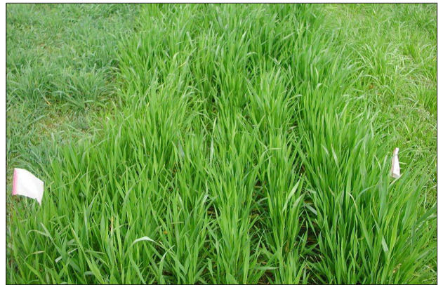
Figure 2. Oats in early spring.