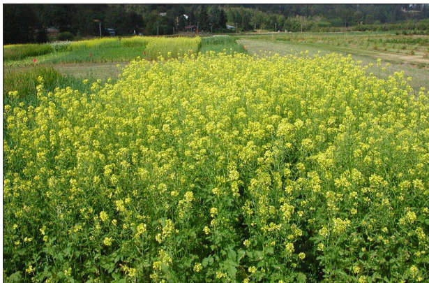
Figure 8. Mustard, member of the brassica family.