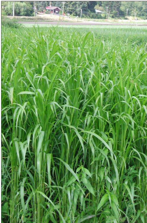
Figure 10. Sorghum-Sudangrass hybrid in midsummer.

Cover crops are commonly grown as mixtures, which can provide a wider range of benefits. Many seed companies sell mixtures, but the content of these mixtures and the ratios of their constituents should be reviewed carefully.