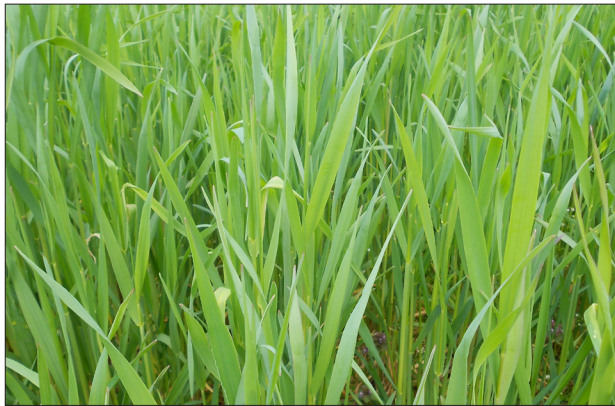
Figure 1. Cereal rye in early spring.