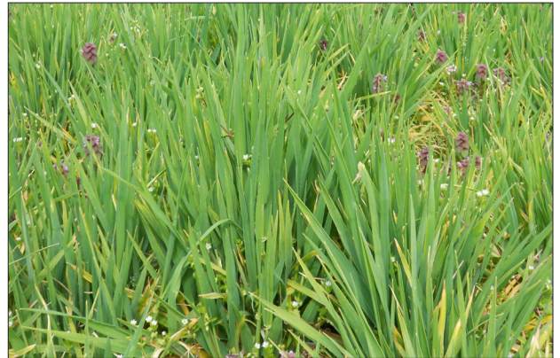
Figure 3. Closeup of Barley in early spring.