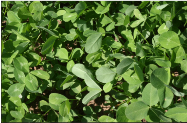
Figure 7. Red clover in early spring.

of northwest Washington, Oregon's Willamette Valley, parts of central Washington, and central and eastern Oregon, thus limiting their use in the Northwest.