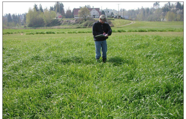
Figure 4. Fall-planted annual ryegrass in early spring.