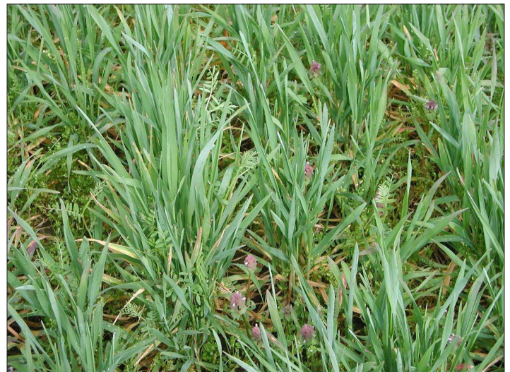
Figure 11. Rye X hairy vetch mix.

Tables 3 and 4 show a range of planting dates for different cover crops. Crops that are planted earlier recover more