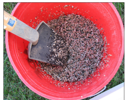
Mixing the wildflower seed with moist vermiculite keeps the seed uniformly well-mixed and easy to spread evenly.