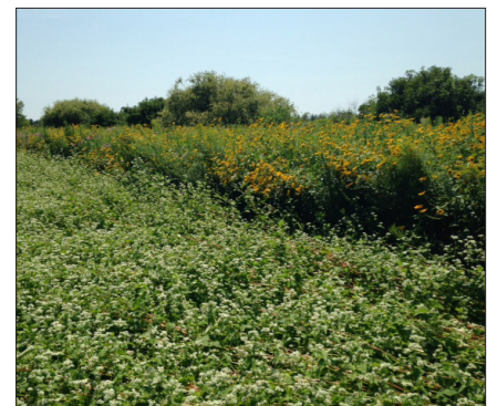
A buckwheat cover crop in front of a previously established meadow.