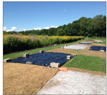
Overview of research trial comparing various methods of site preparation for killing existing vegetation before seeding a meadow mix.