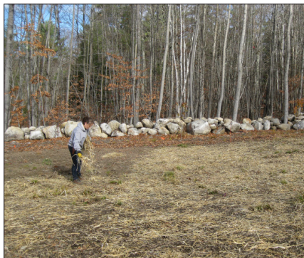
After rolling, cover with a light mulch of clean straw.

When broadcasting seed, divide the total amount of seed in half. Mix the first half with the carrier and spread it as evenly as possible, going back and forth in one direction (following the black lines), then mix and spread the other half in the other direction (blue lines). For large areas, divide the total area into several areas of 400-500 square feet each and spread the seed in each area in this manner to get the most uniform distribution of seed possible.